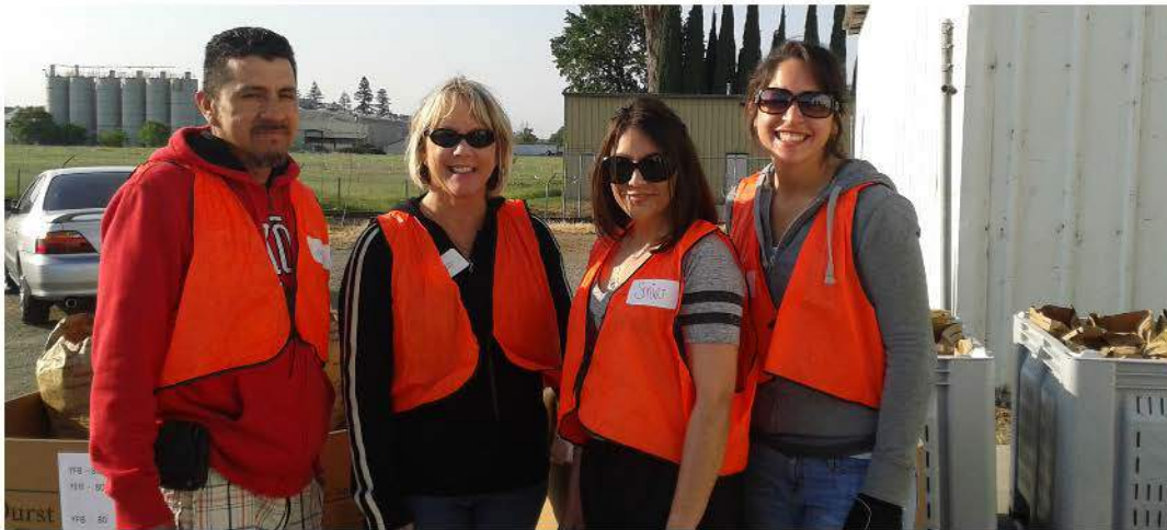
(Spring Holiday Food Distribution volunteers)