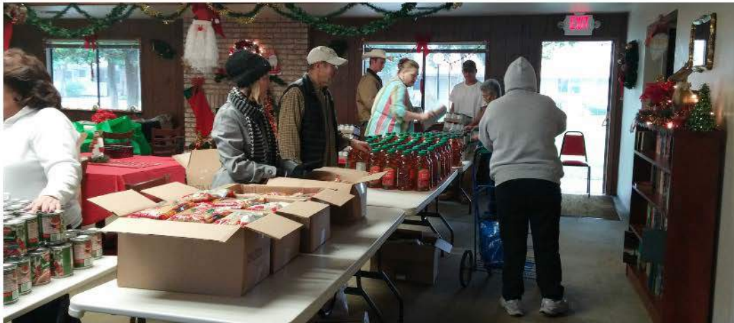
(EFAP Distribution at Summertree Apartments in Woodland)