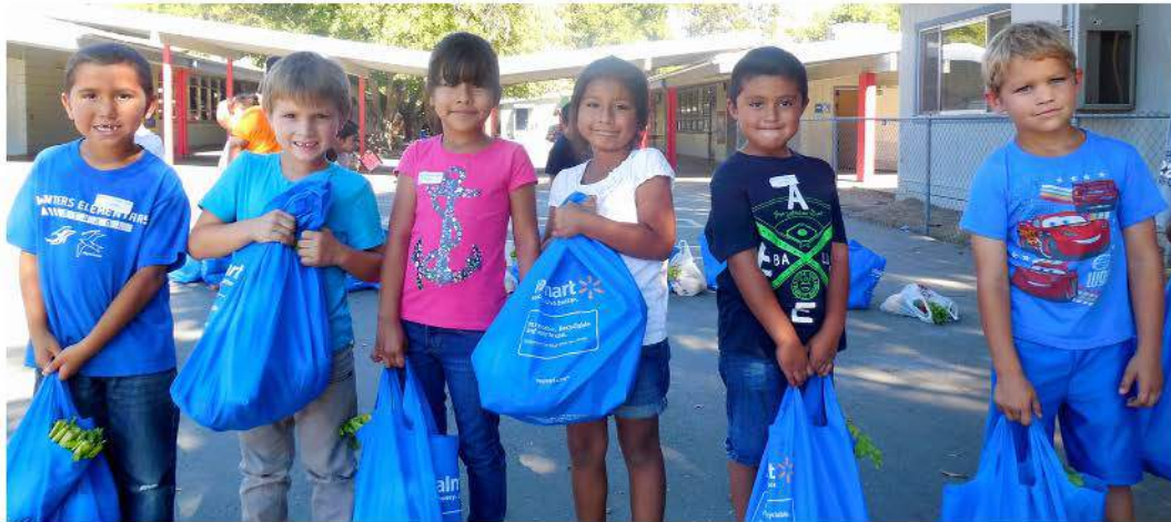
(Kids Farmers Market at Waggoner Elementary in Winters)