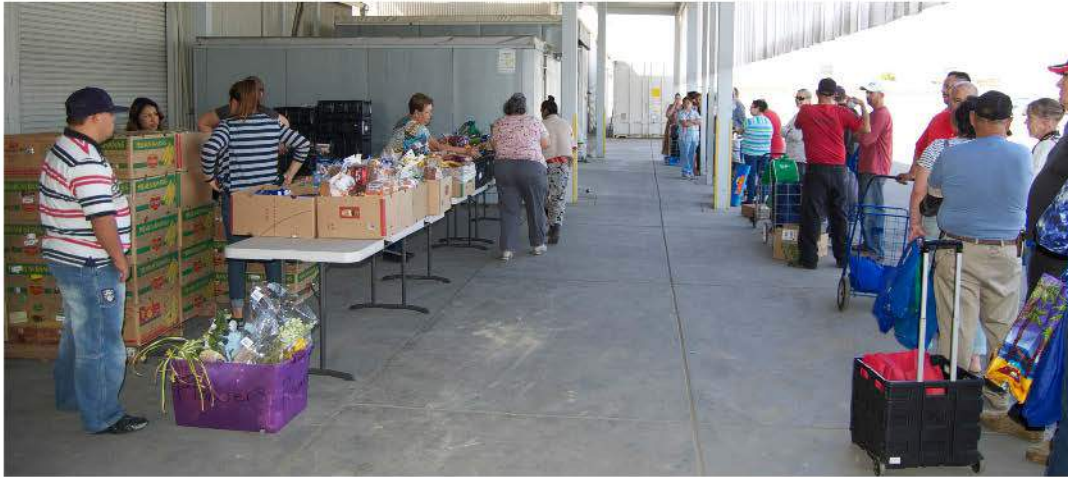
(DFAP Distribution at Yolo Food Bank)